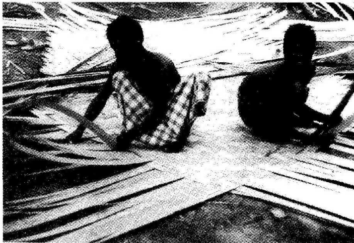
Fig 1 : Bamboo artisans at work

of the vital uses of bamboo is for construction and that it is the most commonly used building material in rural housing of Bangladesh.